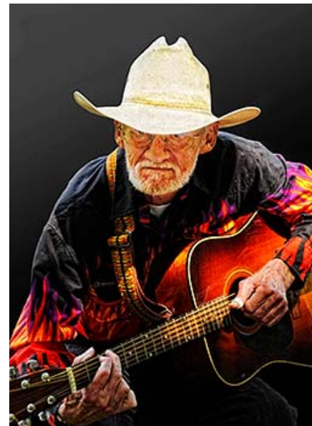
Flat Pickin' by Marvin Gerstein High-scoring March print

So, just as in PJ, present exactly what you found there, and PSA has asked us to encourage the judges to reward images that portray the people and their culture over nature type subjects. Another hint, include enough environment so it is obvious where the photo was taken, and preferably depict some activity, not a close-up or head shot, that could have been taken anywhere. But there are no restrictions on locations—Lancaster is just as good as Mongolia, if it's a good photo showing something of the culture. ☺