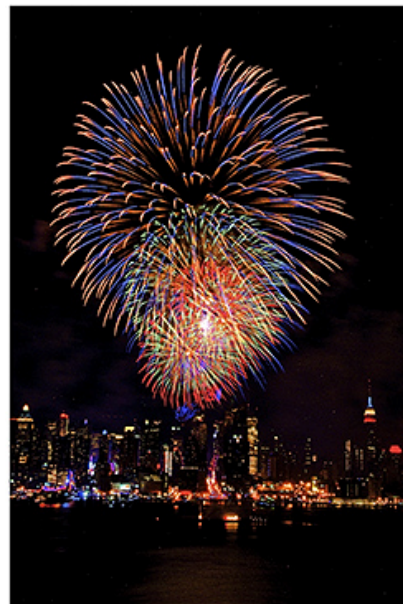
4th of July Fireworks projected image