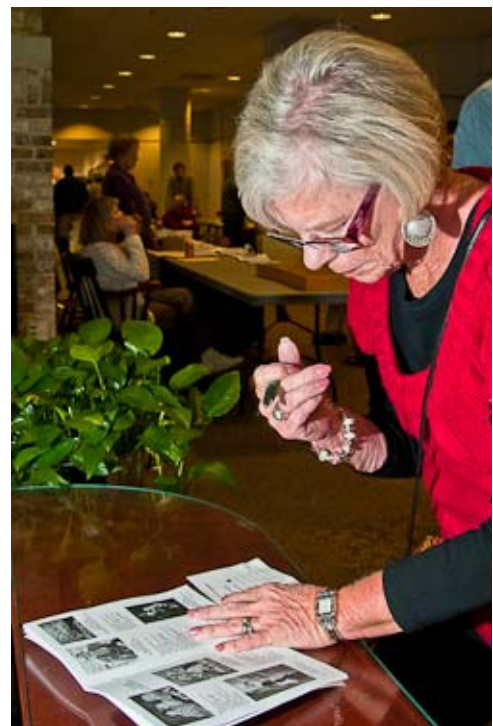
▲ Decisions, decisions. An exhibition visitor fills out her ballot for the Gold Medal Peoples' Choice Award.