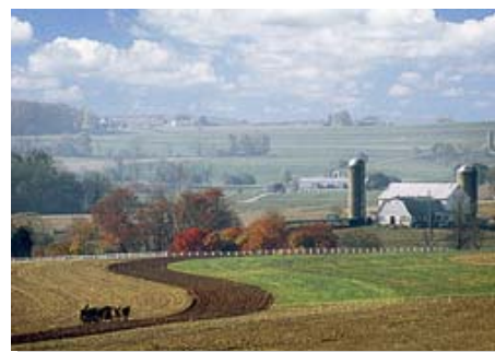
Amish Plowing

I can hear some of the purists already saying, "the image is not a real representation of the original scene!" Will you tell me what is the difference between adding the corrected sky after the fact or before the fact with colored jells, polarizing and/or gradient filters? The only time I can see where it might be taboo to make such changes is when it is being taken for a photojournalism report for historical purpose. It would be nice to have our scenes perfect in every sense, but alas, that is not possible. Having the opportunity to make changes is possible, however, and for that I say "Thank God."