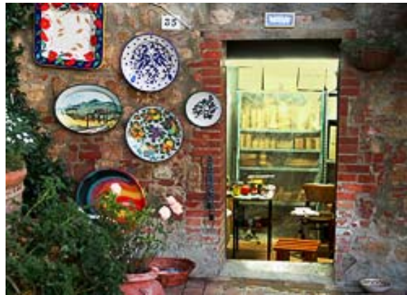
Pienza Ceramics

As for the small hill towns we visited, they won't be included in your average tour, and you'll have trouble finding them if you're traveling on your own. For example, have you ever heard of, or