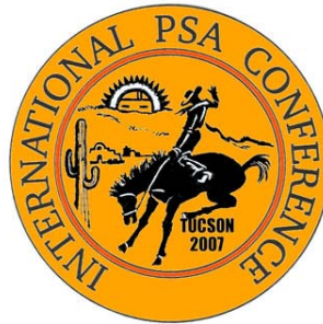
PSA 2007 International Conference of Photography Tucson, Arizona September 2—8, 2007

ton have put together an ad that is currently running. The club plans to change the photos from time to time and we hope you'll agree to use of your photo if called upon. Check out Theater N at www.theatren.org .