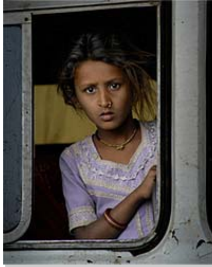
Girl on a Bus © 2006 Karl Leck Color Print of the Year

Nikon D100 with 24-120 VR zoom lens at 120mm was used. The Aperture Preferred automatic exposure was 1/320 second at f/5.6 with sunlight white balance. The capture was in Adobe RGB in JPG Fine. It's nice not to have to keep image notes now that the