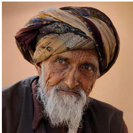
The Rag Turban Digital Image of the Year

I'm sure that our vice president remembers that I began my term in 2005 by leaving town and dumping everything in his lap. He oversaw the first of our monthly digital competitions. Since that time, we have introduced the video camera