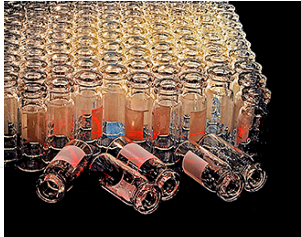
Glass 2 by Don Pivonka High-scoring February print