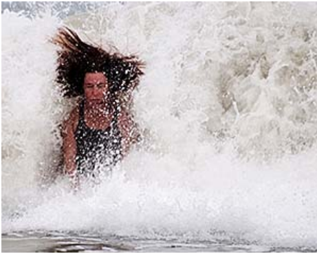
Washing Machine

While on my third deployment to the Western Pacific for Viet Nam, I purchased my first 35mm camera, a Yashica Range Finder. It didn't take