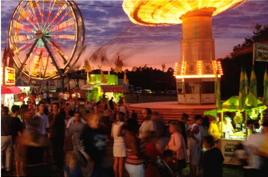
County Fair in Motion