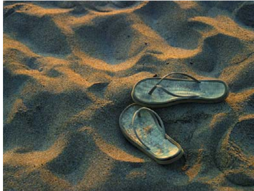
Sandals

In its only meeting, the Exploratory Committee presented a number of ideas for improving the DPS, namely: improving the quality of speaker programs, distributing The Reflector electroni-