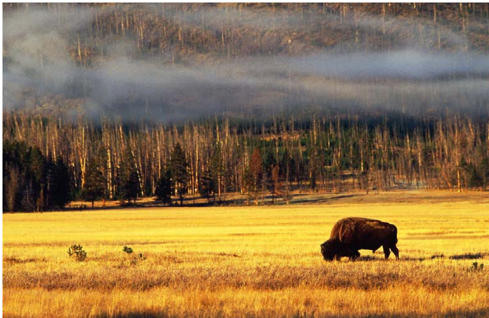
Bison in Fog