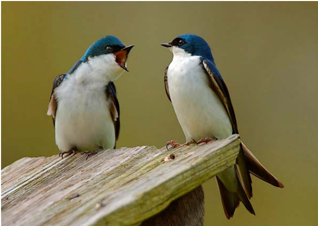
SweetHearts

I received my first camera about age eight, a simple Kodak instamatic camera, but it was enough to get me hooked on photography. My main subjects were animals, though candid shots of people at family gatherings also made for lots of fun, especially those family members who did not want their pictures taken. I enjoyed the challenge of capturing the moment that was not easily obtained.