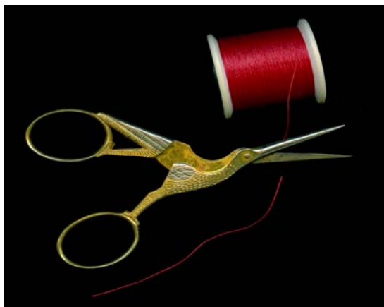
High Scoring October print, Thread Clipping Bird , by Karl Leck. The image was captured on an Epson Perfection 2450 Photo flatbed scanner at 2400 dpi and 48-bit color. The file was 248 MB to make the 16x20" print on Ilford Galerie Glossy paper using an Epson Stylus Pro 4000 printer with Ultrachrome pigment ink.