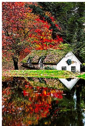
Springhouse by Bob Coffey on display at Longwood Gardens

The juried photo exhibit by DPS members features the extreme beauty and vivid colors of the season. Photographs may be viewed on the DPS Web site. Longwood Gardens hours are from 9am—5pm daily, through November 24. For information on Longwood activities, refer to www.longwoodgardens.org .