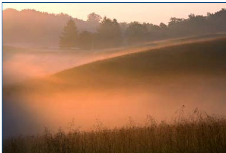
"Winterthur Morning" by JEANNIE ASTIFAN September Projected Image High Score