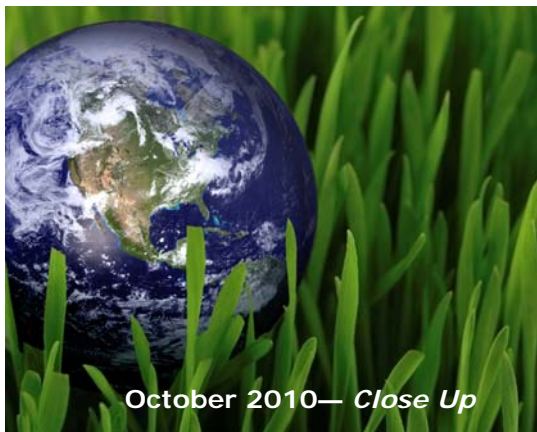
October 2010— Close Up

November 2010 — By Candlelight January 2011 — Rain February 2011 — Glassware March 2011 — < than 1 second exposure April 2011 — Ships and Boats September 2011 — Mist or Fog October 2011 — Selective Focus November 2011 — Land Vehicles in Motion January 2012— From Above February 2012— Interiors March 2012— Bridges April 2012— Waterfalls