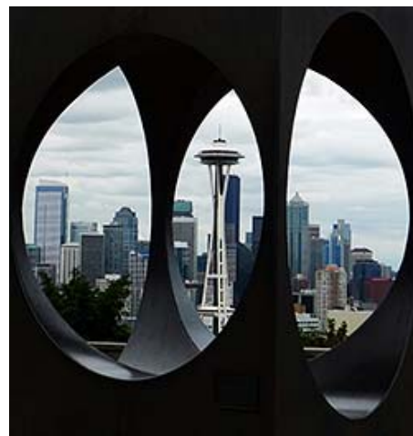
Space Needle Through Sculpture by Frank Czeiner tied for high score in the September Projected Image competition.