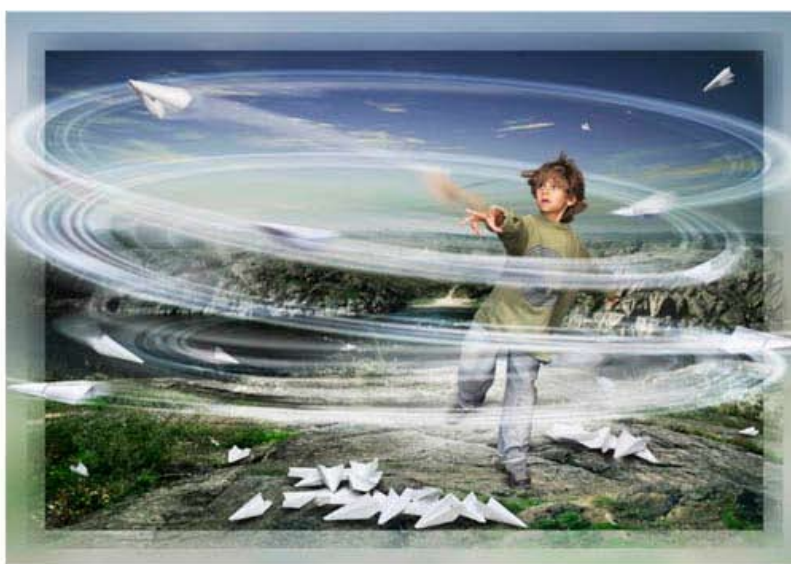
Aviator, 2011 PSA Silver Medal (Best Creative), Mikail Bondar, Ukraine

It's time to enter Delaware Photographic Society's annual competition. WIEP is one of the oldest and largest juried photographic exhibitions in the USA. It is PSA recognized and attracts photographers from all over the world.